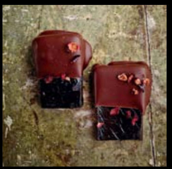
BLACK CURRANT FRUIT JELLY

Natural sea buckthorn fruit jelly glazed in milk chocolate and decorated with a pinch of dried sea buckthorn berries. Bright, fresh, bitter-sweet. Strong and powerful like the northern winters, soft and splendid like the northern summers. Having met the mild milk chocolate, they begin to dance. That's what it is – wild sea buckthorn fruit jelly – tangy, deep and true.