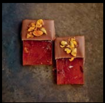
SEA BUCKTHORN FRUIT JELLY

Natural blueberry fruit jelly glazed in white chocolate and sprinkled with a pinch of freeze-dried bilberries. Velvety soft. Like a silk dress against fresh moist moss or a newly laid red carpet. Feminine passions curled in white chocolate. That's what it is – wild bilberry fruit jelly – velvety soft, deep and true.