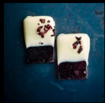
BLUEBERRY FRUIT JELLY

Natural quince fruit jelly, glazed in dark chocolate and decorated with candied quince. Sparkling as champagne during an opera interval. Like a sweat and sour sunset on the shore of a storm torn sea. A taste of un-tamed freedom, tamed by dark chocolate. That's what it is – wild quince fruit jelly – sparkling, deep and true.