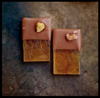
RHUBARB FRUIT JELLY

Natural cranberry fruit jelly, glazed in white chocolate and sprinkled with a pinch of freeze-dried cranberries. Playful, intoxicating, these are the rosy diamonds of the swamp. Temptingly hidden in a white chocolate cloak, they entice with their glory and colours. That's what it is – wild cranberry fruit jelly – playful, deep and true.