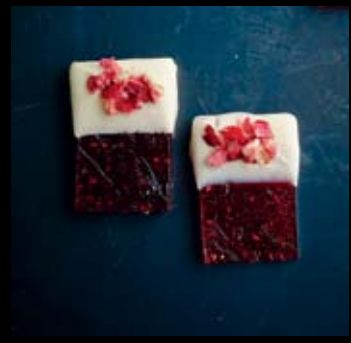
CRANBERRY FRUIT JELLY

Quince, blackcurrant, sea buckthorn, rhubarb, cranberry and blueberry fruit from the Latvian countryside stewed in its own natural juices to make fruit jellies. Dipped half way in dark, milk or white chocolate and topped with pieces of freeze-dried fruit or succades. Genuine, without deception or fraud. Beautiful, colourful, natural. From real berries, fruits and juices. Searched for, found and gathered. Prepared, cooked and poured by the Northern maidens. It's an experience of sweet and sour taste.