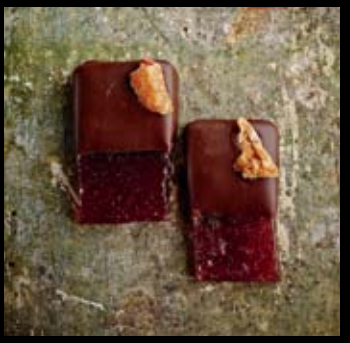
QUINCE FRUIT JELLY

Natural rhubarb fruit jelly, glazed in milk chocolate and decorated with candied rhubarb. Proud, tangy, sweet and sour like the last frost of the spring. Deep but yielding. Its effervescent character is tempered by its milk chocolate casing. Deep and true is this wild rhubarb fruit jelly.